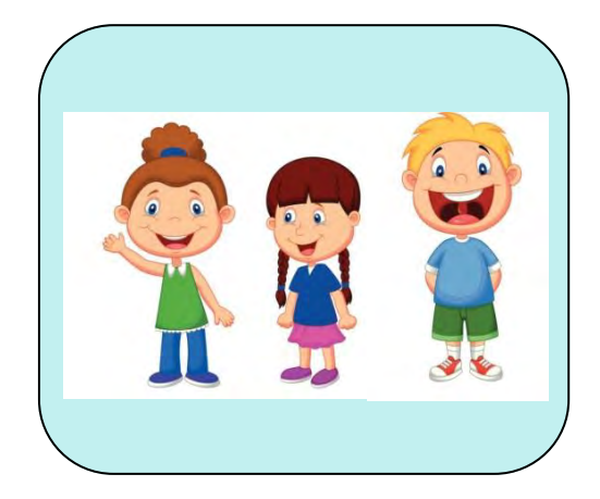
Waiting Your Turn