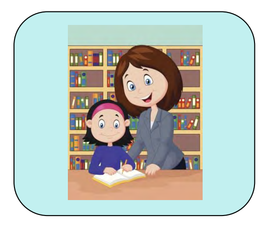
Asking for Help