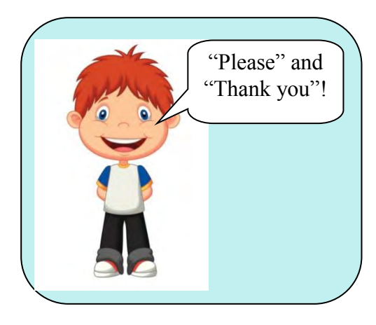
Please and Thank You