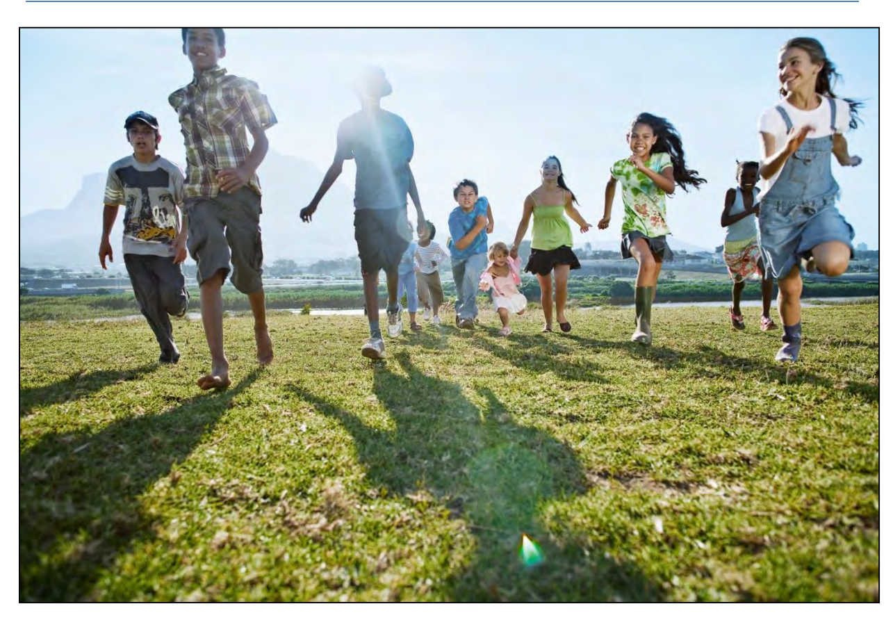
The Sixth Protective Factor in a Series of Six

Institute for Family Violence Studies College of Social Work Florida State University <a href="http://familyvio.csw.fsu.edu">http://familyvio.csw.fsu.edu</a>