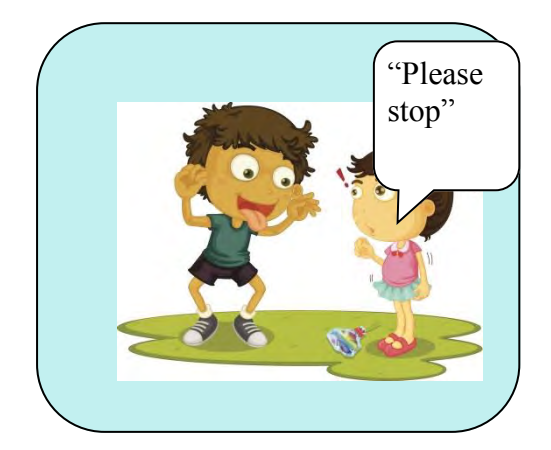
Asking to Stop Politely