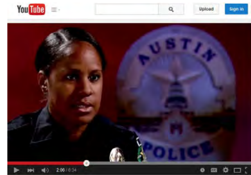
Austin Police Recruiting