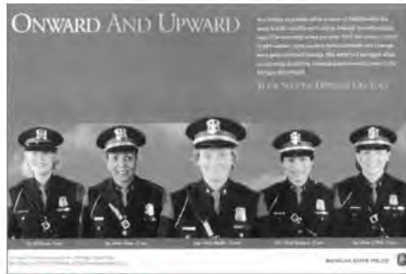
Michigan State Police Recruiting Poster

The Michigan State Police Department uses the faces of women on its advertising material and promotes female values of motherhood, health, and strength.